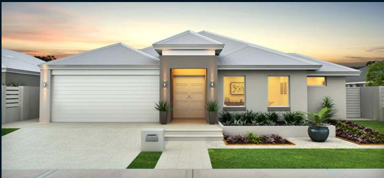
(above) - The Delaware

LIFESTYLE HOMES has established a reputation for building exceptional new luxury homes throughout Perth and the South West. They offer a wide choice of single and two-storey home designs, which can be personalised to suit your lifestyle.