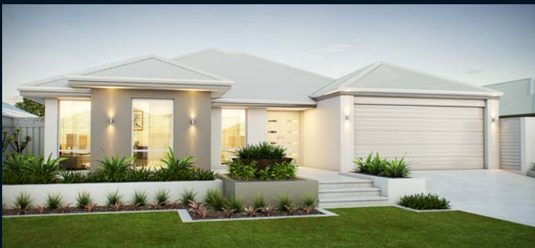
(above) - The Liberty 226