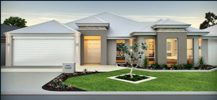
(above) - The Jefferson